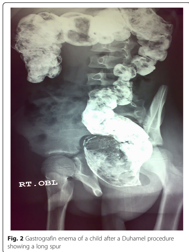
Fig. 2 Gastrografin enema of a child after a Duhamel procedure showing a long spur

complications after pull-through are anastomotic stricture, long obstructing seromuscular cuff, long spur after a Duhamel procedure, twisted pull-through, or retained aganglionosis. The clinical manifestations of these complications are persistent constipation, recurrent enterocolitis, or stool incontinence [7].