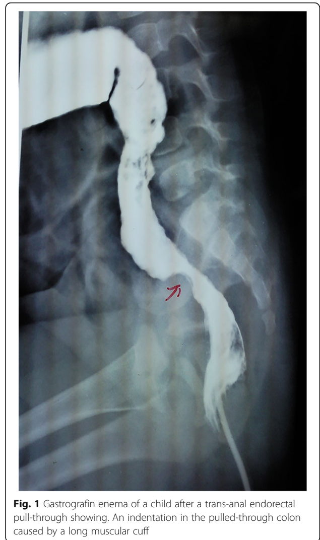
Fig. 1 Gastrografen enema of a child after a trans-anal endorectal pull-through showing. An indentation in the pulled-through colon caused by a long muscular cuff

One of the six patients who underwent abdominal Soave technique developed a tight long stricture (Fig. 3) and required a redo pull-through (abdominal assisted pull-through); in one patient, biopsy confirmed hypoganglionosis of the whole colon and was managed medically